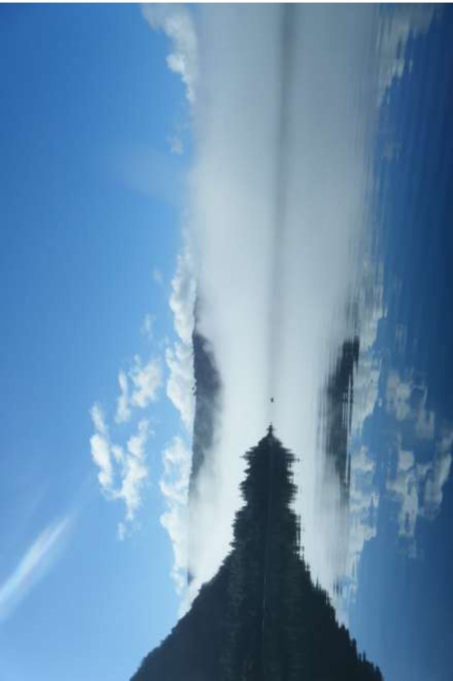
A misty morning at Lake Okataina