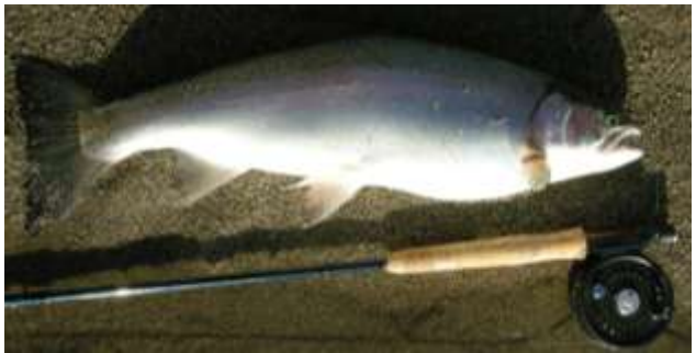
Magnificent trout caught by our guest speaker from California at L Tarawera.