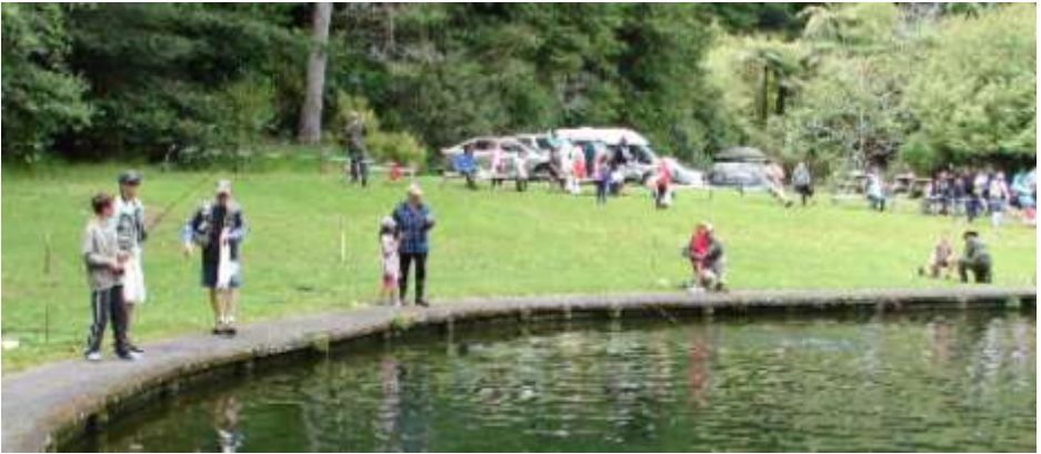
Some photo's from the final Kid's Fishout for the year.